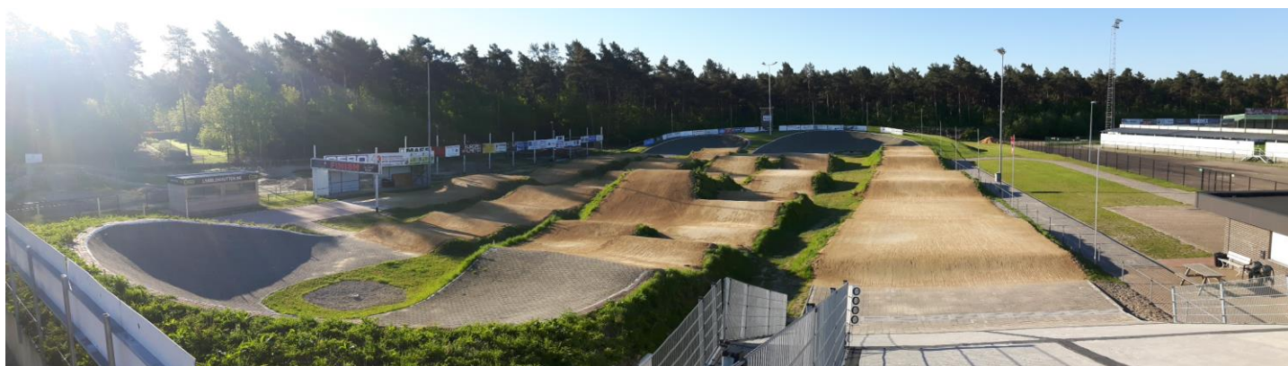
Layout 3 Nations 2019